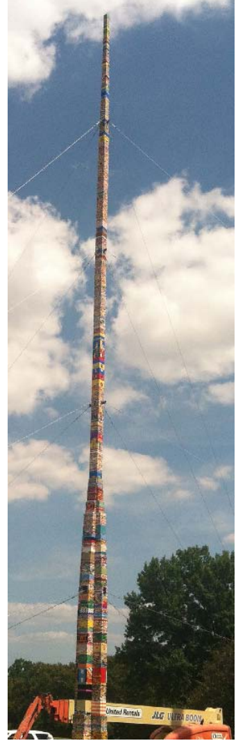
January 2014, Vol. 11, No. 1

Awesome Maps and Data Visualizations from 2013 - Part 1