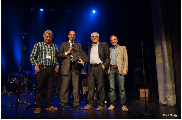
eENVplus receive during the INSPIRE Conference the CEN/TC 287 Award for Excellence and Innovation

manage.com/track/click?u=8ef0ebb40bd12bfe1546b7bc 8&id=a1d846acac&e=787eb3280c