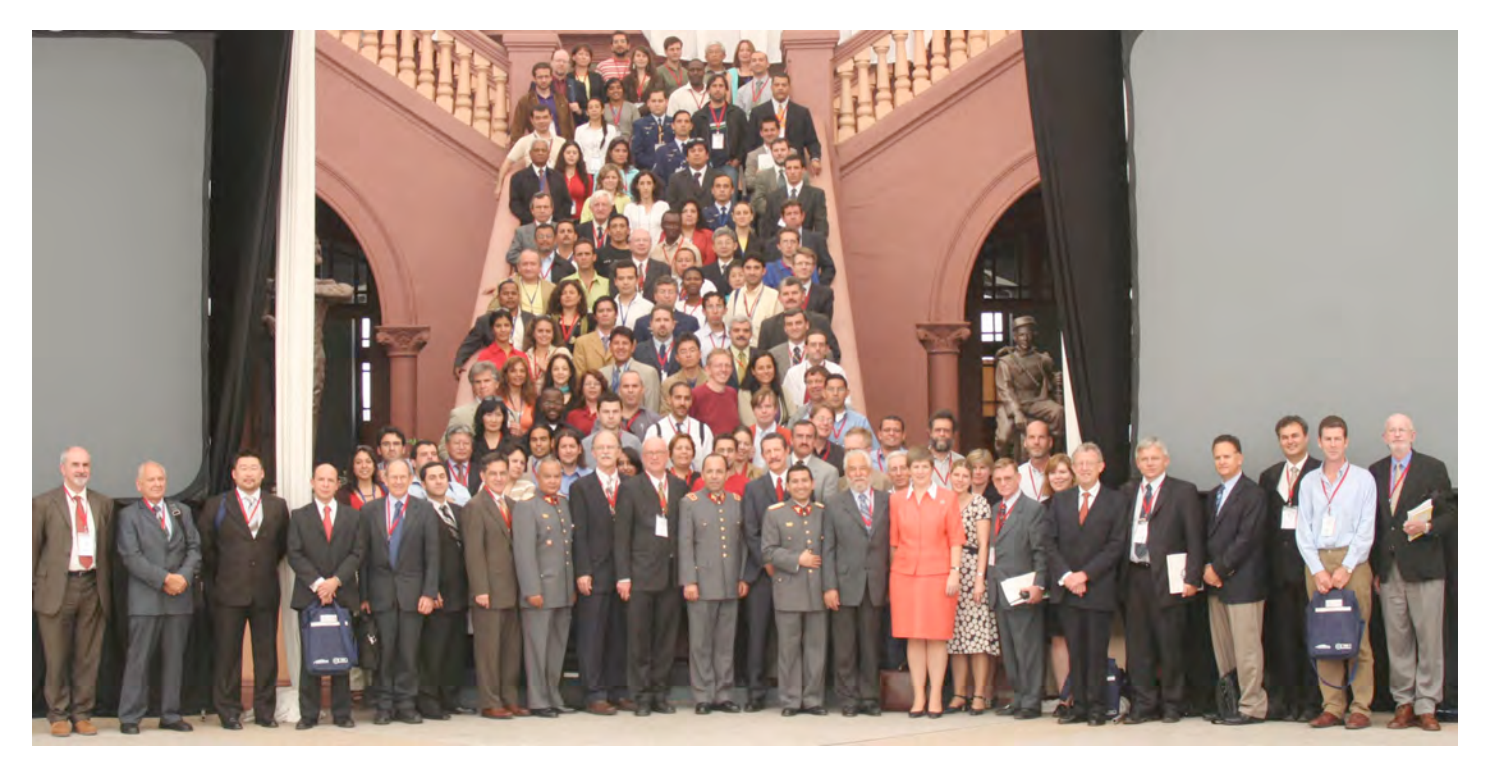
Group photo after last session at GSDI 9 Conference in Santiago